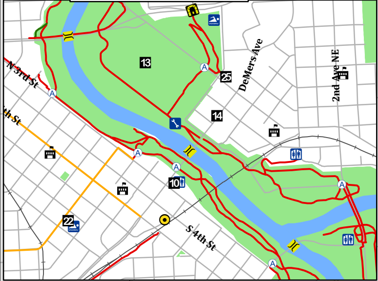
Inset of Downtown

DISCLAIMER: The bikeway system is shown as of Feb. 2024. Please use caution and obey all posted signage and vehicle codes. Bike facilities throughout the system are subject to closure due to construction or other circumstances at any time. While every effort has been made to provide a high quality, accurate, and usable map, the depicted bikeway information is advisory only. Map users assume all risks as to the quality and accuracy of the map information, and agree that their use is at their own risk. Please forward all comments & corrections for this map to the GF/EGF MPO.